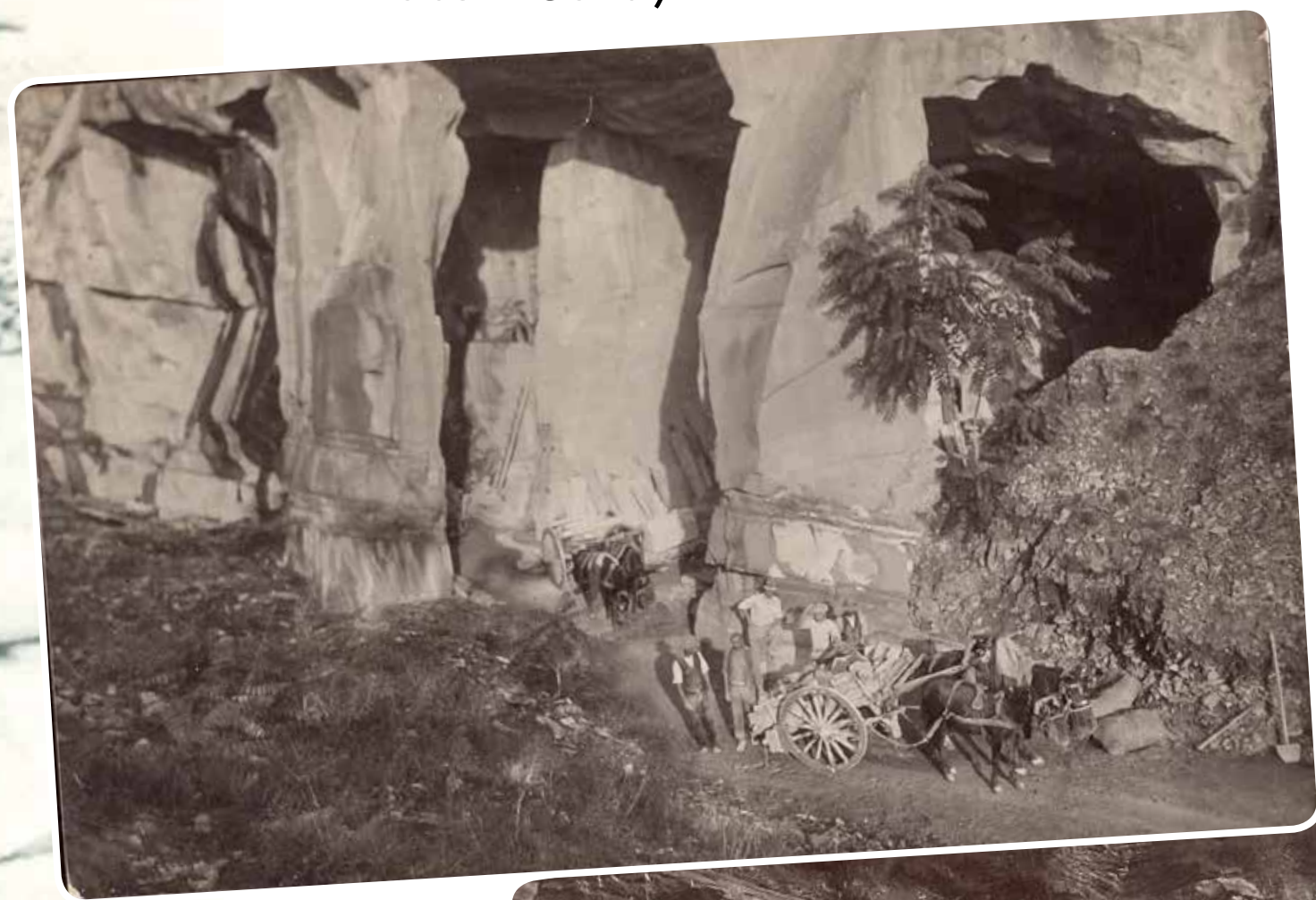
Municipal Archives of Fiesole, Ranfagni Fund